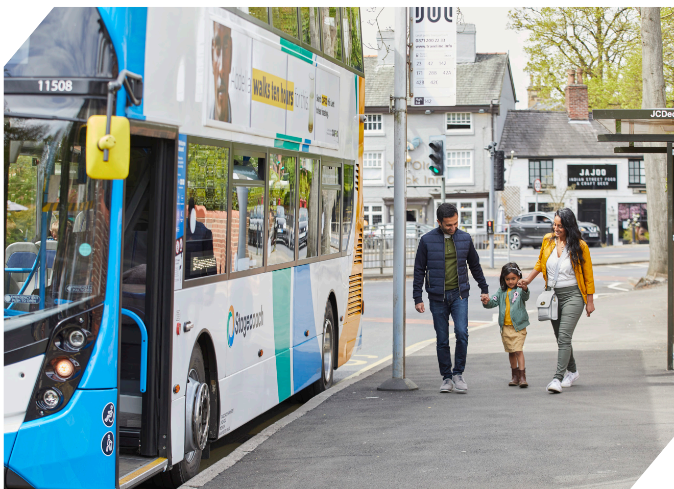
Portfolio asset: Stagecoach